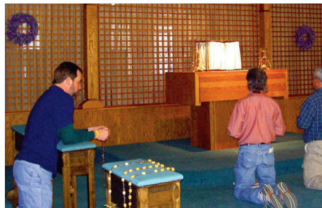
Sanctuary and chapel for private or group prayer and worship

The Augustine Center is a Catholic retreat house at the Sacramentine Monastery, near Petoskey, Michigan. The tranquil setting, nestled between a nature preserve, woodlands, and Crooked Lake, provides support for prayer and relaxation. Walk the outdoor labyrinth, pray at the wayside shrine, or contemplate the pillared Stations of the Cross. Walking paths, gazebos, and comfortable outdoor seating compliment a spacious facility with private bedrooms, meetings spaces, and a chapel.