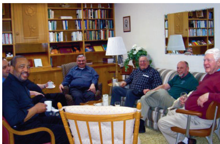
A variety of sitting rooms for conversation or reflection