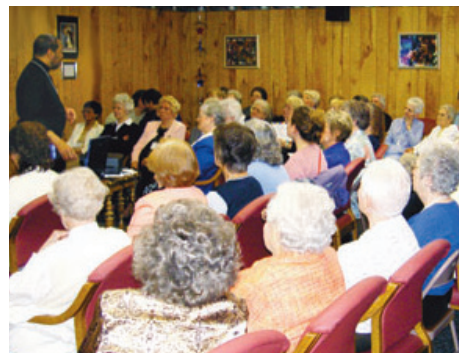
Siena Hall seats up to 75