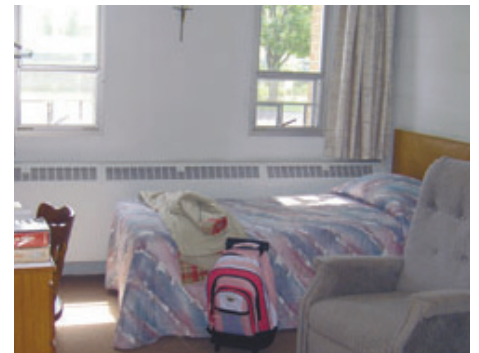
Bedrooms with private bathrooms