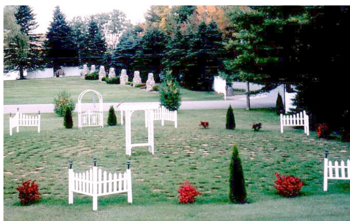
Labyrinth and Stations of the Cross